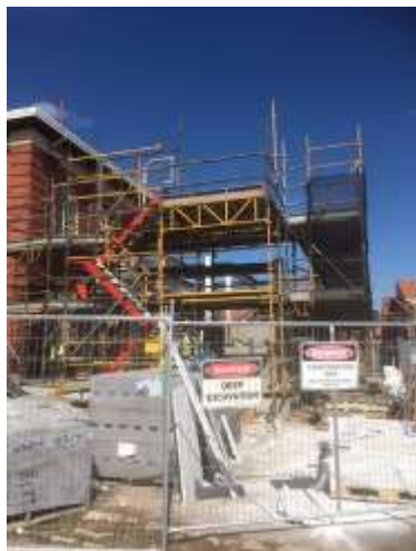
Hall Building Progress