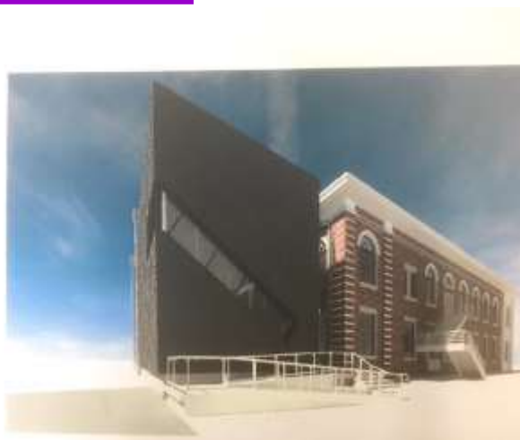
Hall Proposed Extension