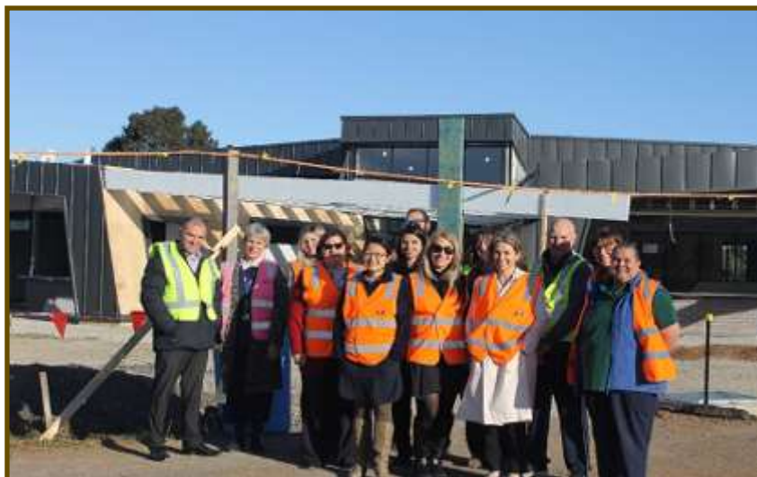
The Niddrie Staff Tour the site of the new Niddrie Junior Campus