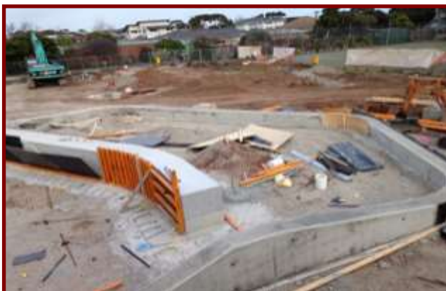
Niddrie Campus - The New Amphitheatre Under Construction

Preparation for 2019 has commenced so I ask any family who will not be attending the College next year to confirm this by completing an exit form at the general office. We are all looking forward to using the new facilities during Term 4.