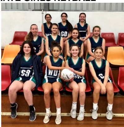
YEAR 8 GIRLS NETBALL