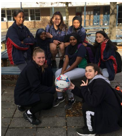
INTERMEDIATE GIRLS NETBALL