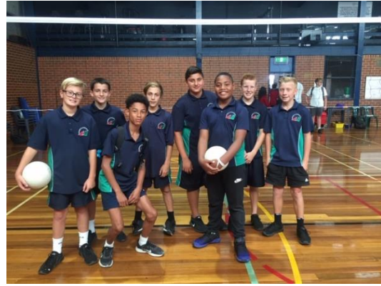
YEAR 7 BOYS VOLLEYBALL

We look forward to the following sporting events that will be happening during Term 3: