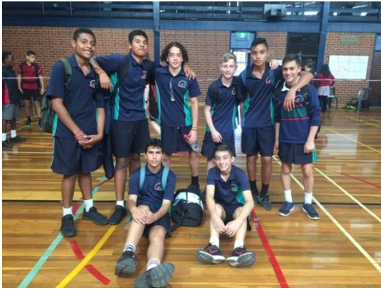
YEAR 8 BOYS VOLLEYBALL