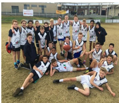
YEAR 7 BOYS AFL