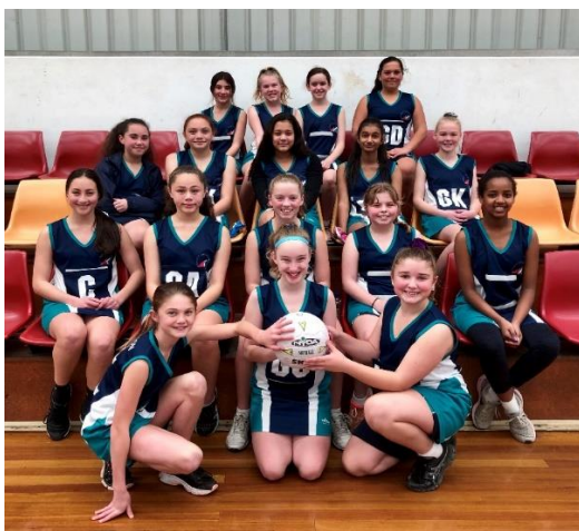
YEAR 7 GIRLS NETBALL